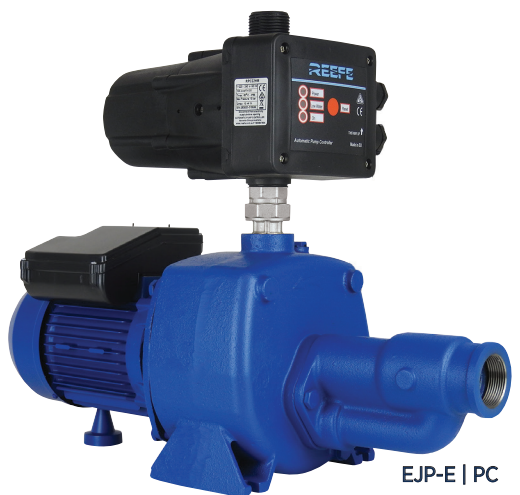
EJP-E | PC